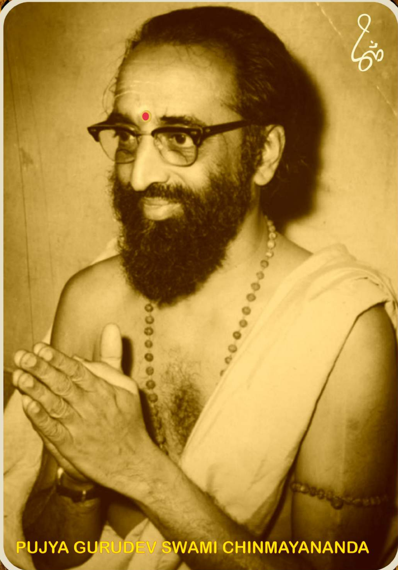
PUJYA GURUDEV SWAMI CHINMAYANANDA